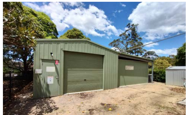
The unit currently sits on prime real estate in the middle of The University of Sydney's main Darlington campus