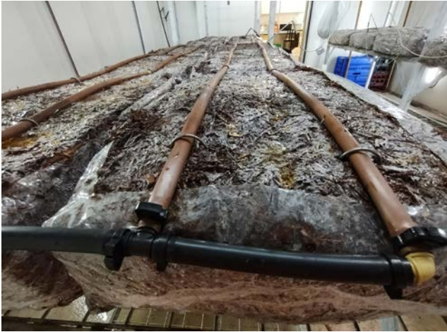
Drip irrigation trial before (left) and after (right) casing